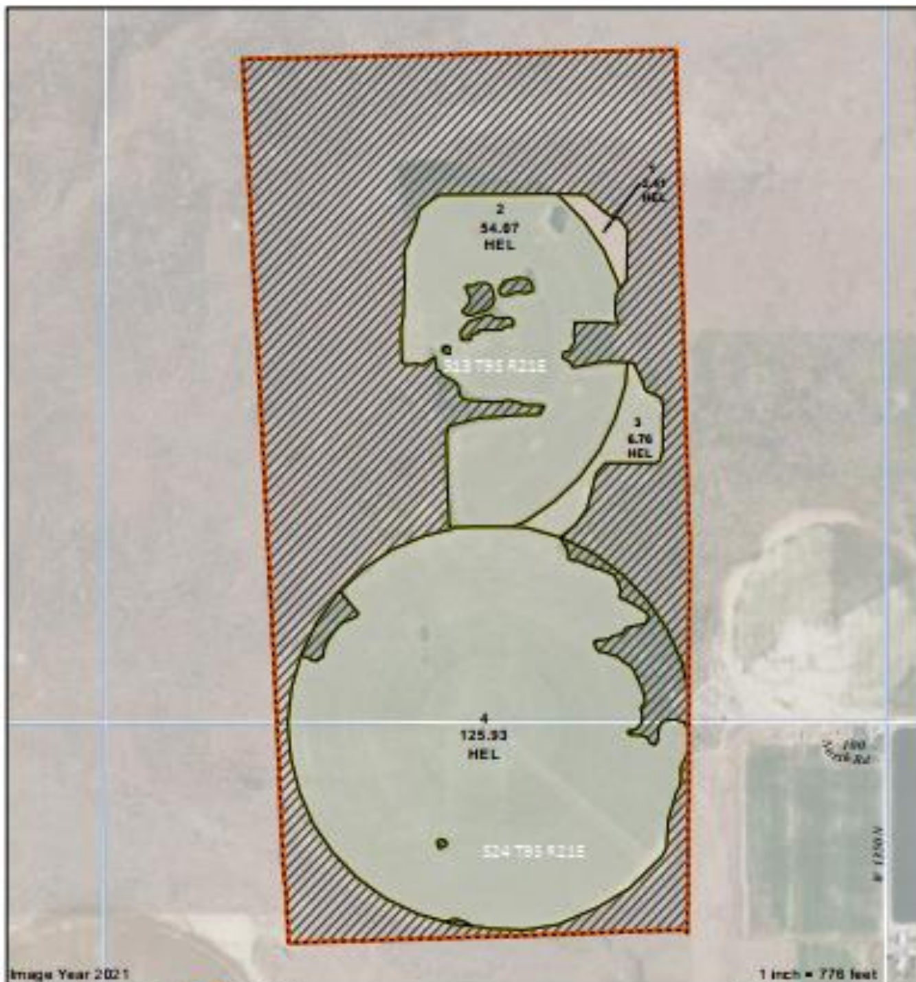
Image Year 2021